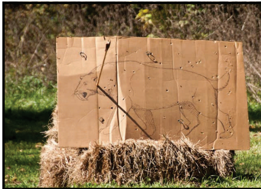
A Perfect Throw!